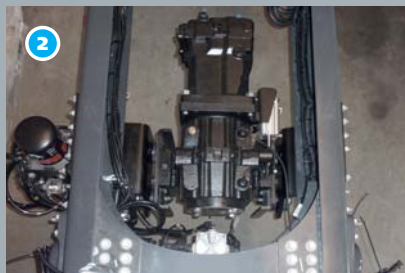
The HS 3000

The system is powered by a rear engine PTO. Thanks to the power-optimised engine usage strategy, the vehicle achieves excellent emissions values.