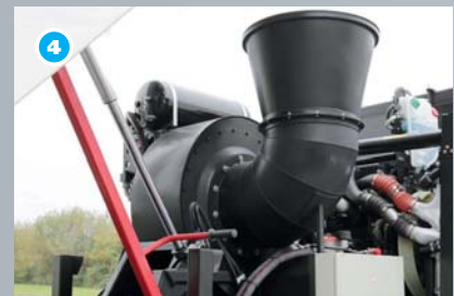
The suction fan

As an option, a powerful auxiliary engine, boasting the latest exhaust gas treatment technology and high-efficiency, powerful hydraulics, can be fitted to drive the high-performance suction fan and other consumers.