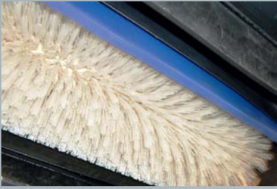
Glycol suction system integrated into sweeping unit