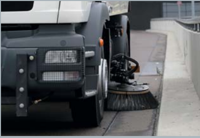
Disc brooms on right and left-hand sides