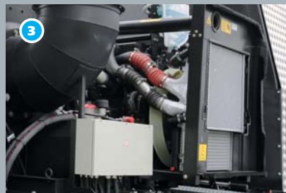
The auxiliary engine

The system is powered by a rear engine PTO. Thanks to the power-optimised engine usage strategy, the vehicle achieves excellent emissions values.