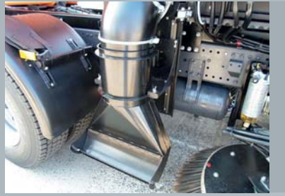
Blower nozzles can be directed manually or from cab