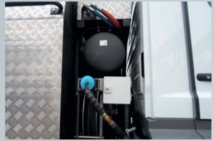
Hot-water cleaning systems