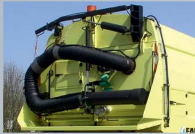
Manual suction system at the rear