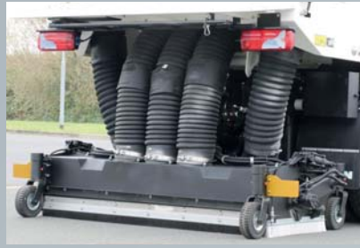
HP bar on sweeping unit